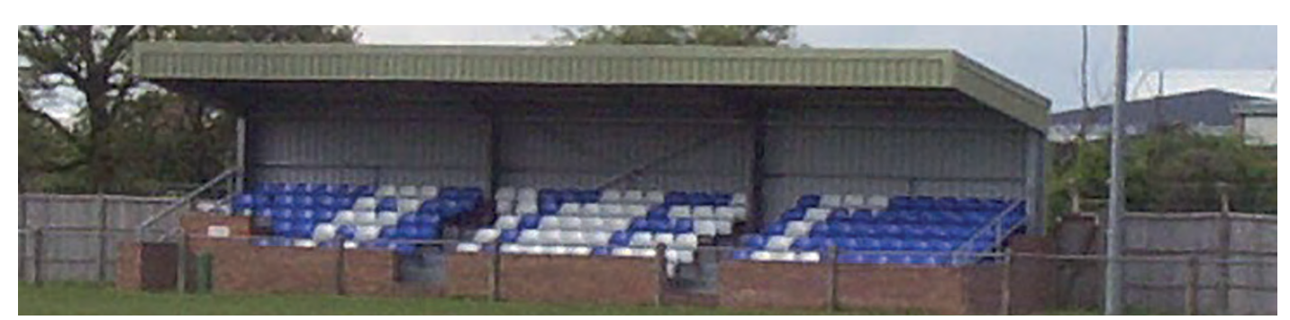
•Staines & Lammas will play their home games at Ashford Town (Middx).

BEDFONT BELSTONE BROOK HOUSE CHALFONT ST PETER COLLIERS WOOD UNITED EVERSLEY & CALIFORNIA FC DEPORTIVO GALICIA HILLINGDON BOROUGH HOLMER GREEN LANGLEY LONDON SAMURAI ROVERS MOLESEY OXHEY JETS PFC VICTORIA PENN & TYLERS GREEN RISING BALLERS KENSINGTON SPARTANS YOUTH STAINES & LAMMAS WESTSIDE WINDSOR WINDSOR & ETON WOODLEY UNITED YATELEY UNITED