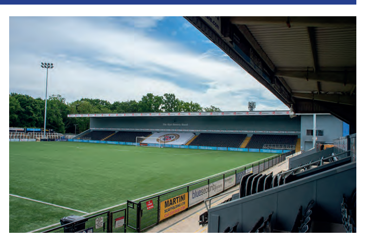
WHO PLAYS AT THE GROUND PICTURED? Answers on Page 14