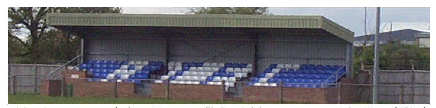
It has been rumoured Staines & Lammas will play their home games at Ashford Town (Middx).

BEDFONT BELSTONE BROOK HOUSE CHALFONT ST PETER COLLIERS WOOD UNITED EVERSLEY & CALIFORNIA FC DEPORTIVO GALICIA HILLINGDON BOROUGH HOLMER GREEN LANGLEY LONDON SAMURAI ROVERS MOLESEY OXHEY JETS PFC VICTORIA PENN & TYLERS GREEN RISING BALLERS KENSINGTON SPARTANS YOUTH STAINES & LAMMAS WESTSIDE WINDSOR WINDSOR & ETON WOODLEY UNITED YATELEY UNITED