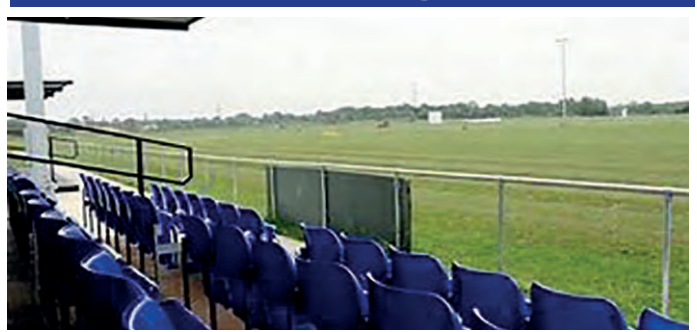
Eversley Sports Association Fox Lane, off Reading Road, Eversley, RG27 0NS

Directions: From the ground, aim for the Uxbridge Road/A4020 via Kingshill Avenue and Lansbury Drive. Follow the A4020 aiming for West Drayton Road/B465. and Stockley Road/ A408 to reach the Heathrow Interchange, to merge on to M4. West then the M25 and M3 towards Southampton.