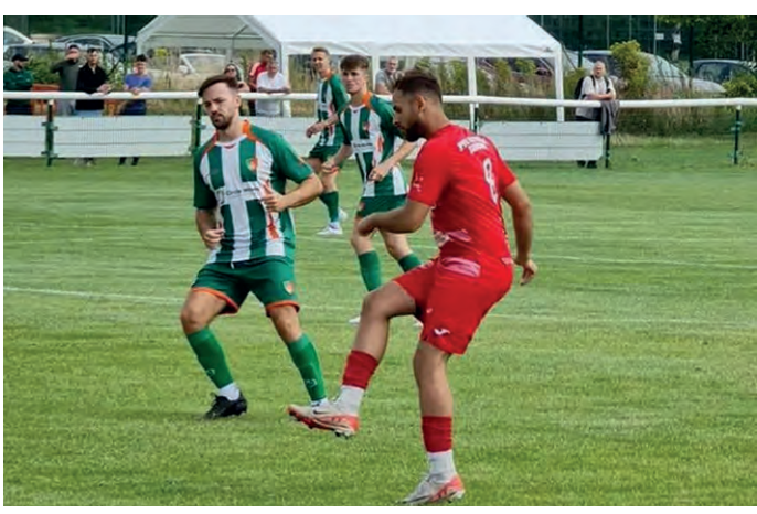
PFC Victoria, red shirts, in their first game at Step Six. They lost 3-2 at Yateley United.