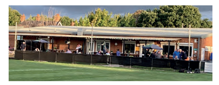
Addlestone Moor, Addlestone, KT15 2QH

Directions: From the ground, aim for the Uxbridge Road/A4020 via Kingshill Avenue and Lansbury Drive. Follow the A4020 aiming for West Drayton Road/B465. and Stockley Road/A408 to reach the Heathrow Interchange.