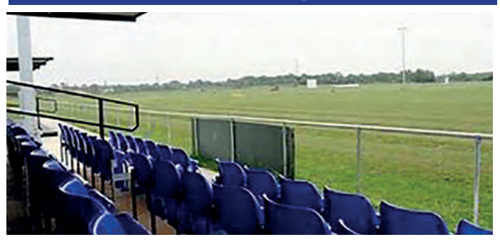
Eversley Sports Association Fox Lane, off Reading Road, Eversley, RG27 0NS

Directions: From the ground, aim for the Uxbridge Road/A4020 via Kingshill Avenue and Lansbury Drive. Follow the A4020 aiming for West Drayton Road/B465. and Stockley Road/A408 to reach the Heathrow Interchange,to merge on to M4.West then the M25 and M3 towards Southampton.