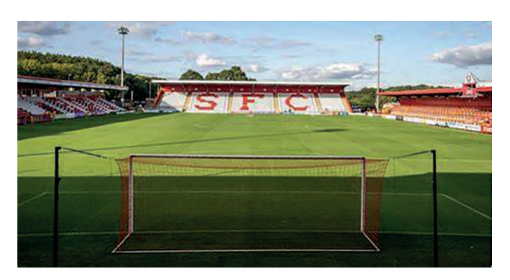
WHO PLAYS AT THE GROUND PICTURED?