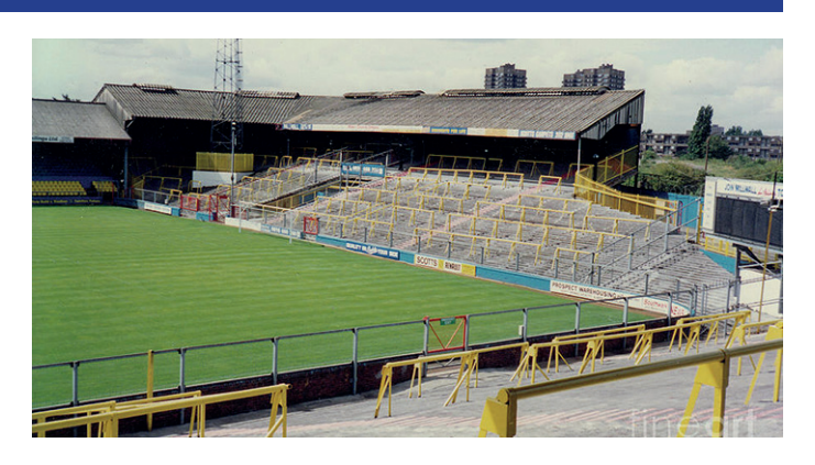
WHO PLAYED AT THE GROUND PICTURED?