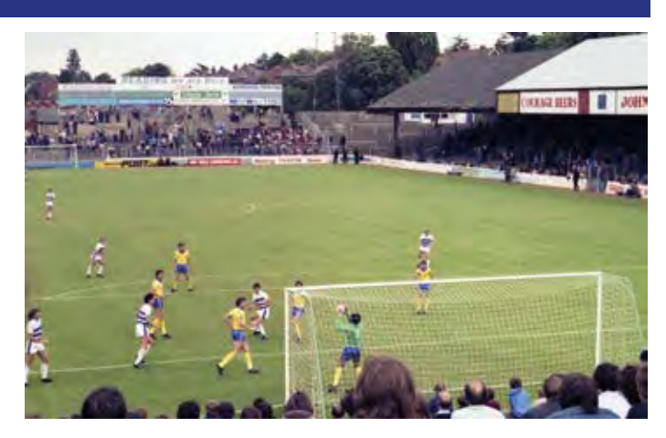
WHO PLAYED AT THE GROUND PICTURED?