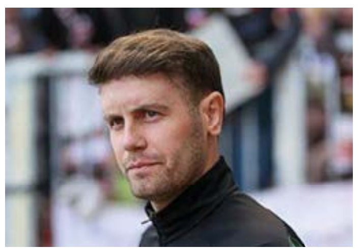
WHO IS THE HEAD COACH PICTURED?

5. Who is the head coach/manager pictured?