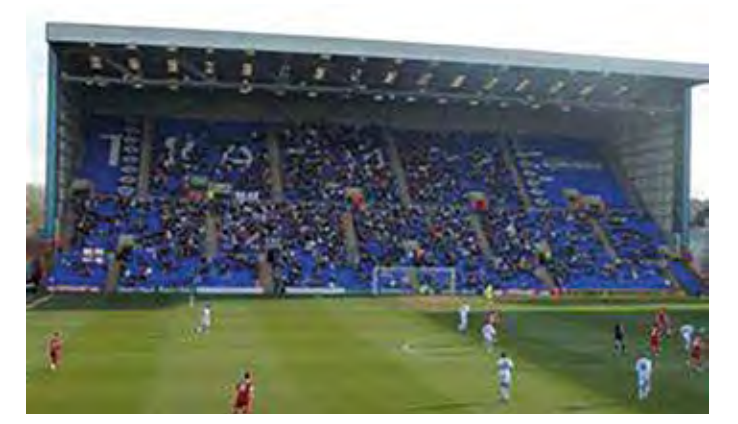
WHO PLAYS AT THE GROUND PICTURED?

5. Which club plays at the ground pictured?