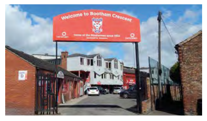
WHO PLAYED AT THE GROUND PICTURED?

5. Which club played at the ground pictured?