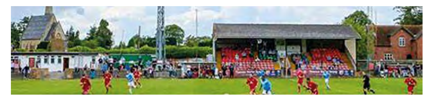
• Windsor & Eton play their home games at the traditonal Stag Meadow ground.

BEDFONT BELSTONE BROOK HOUSE CHALFONT ST PETER COLLIERS WOOD UNITED EVERSLEY & CALIFORNIA FC DEPORTIVO GALICIA HILLINGDON BOROUGH HOLMER GREEN LANGLEY LONDON SAMURAI ROVERS MOLESEY OXHEY JETS PFC VICTORIA PENN & TYLERS GREEN RISING BALLERS KENSINGTON SPARTANS YOUTH STAINES & LAMMAS WESTSIDE WINDSOR WINDSOR & ETON WOODLEY UNITED YATELEY UNITED