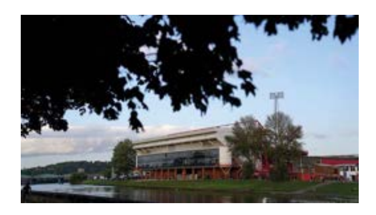
WHO PLAYS AT THE GROUND PICTURED?