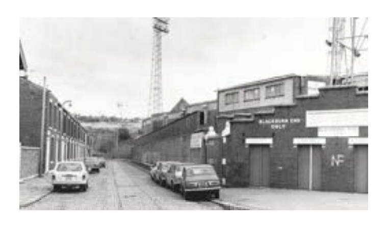
WHO PLAYS AT THE GROUND PICTURED?