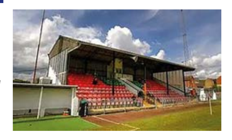
Stag Meadow, St Leonards Road, Windsor SL4 3DR

Turn left on to St Leonards Road and destination will be on the right.