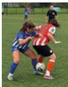
Ashford Town (Middx) v Hendon