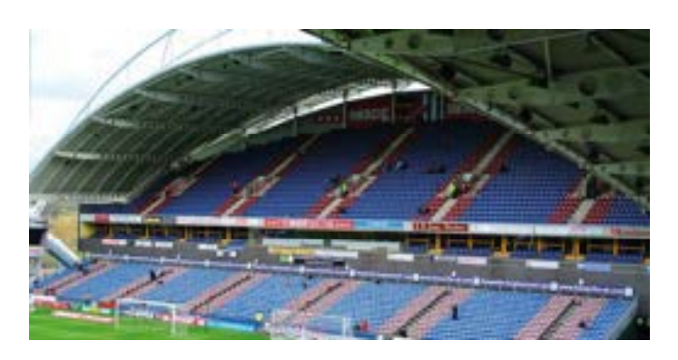
WHO PLAYS AT THE GROUND PICTURED?