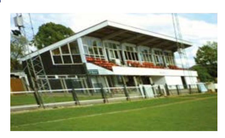
Walton Road, West Molesey, Surrey KT8 2JG

At Cranford Parkway Interchange, take the third exit and stay on The Parkway/A312. At Waggoners Roundabout, take the second exit and stay on The Parkway/A312. Continue to follow A312. At Apex Corner, take the third exit on to Hampton Road E/A312. At the roundabout take the first exit on to Uxbridge Road/A312. Then turn right on to High Street/A311. Continue straight on to Church Street/A311 then left on to Hampton Court Road/A308. At Hampton Court Roundabout take the second exit on to Hampton Court Way/A309. Turn right on to Creek Road/B3379.At the roundabout, take the second exit onto Walton Road/B369 and turn left on to Mole Place.