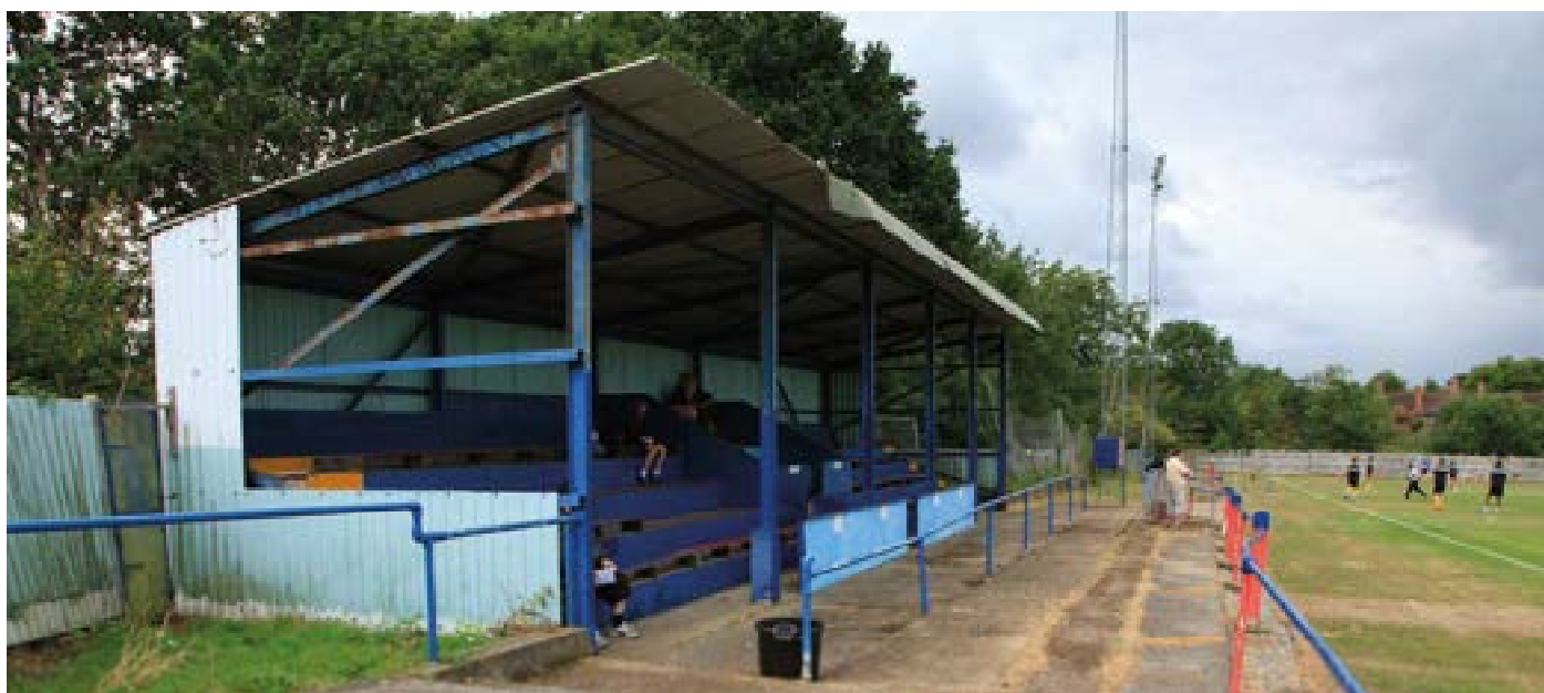
Prince George's Playing Fields, Grand Drive, Raynes Park, SW20 9HA

Directions: From Short Lane aim for the M25 via London Road/A30. As you approach the M25, head towards A308/Bagshot/Egham/Windsor. Then take the M25(S) slip road on the right. Merge on to the M25.