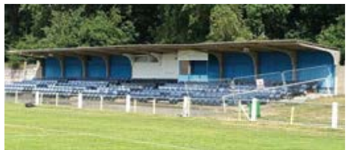
Middlesex Stadium Breakspear Road Ruislip HA4 7SB

Take the B467 towards Uxbridge/Harefield/Ickenham. At Swakeleys Roundabout take the third exit to stay on B467 and take 2nd exit at next roundabout to stay on B467. At the next roundabout take the first exit on to Breakspear Road South. After 1.2 miles turn right on to Breakspear Road and after 0.6 miles turn left to reach destination.