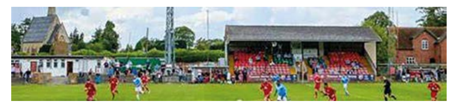
• Windsor & Eton play their home games at the traditonal Stag Meadow ground.

BEDFONT BELSTONE BROOK HOUSE CHALFONT ST PETER COLLIERS WOOD UNITED EVERSLEY & CALIFORNIA FC DEPORTIVO GALICIA HILLINGDON BOROUGH HOLMER GREEN LANGLEY LONDON SAMURAI ROVERS MOLESEY OXHEY JETS PFC VICTORIA PENN & TYLERS GREEN RISING BALLERS KENSINGTON SPARTANS YOUTH STAINES & LAMMAS WESTSIDE WINDSOR WINDSOR & ETON WOODLEY UNITED YATELEY UNITED