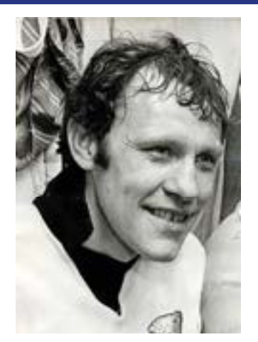
WHO IS THE PLAYER PICTURED? Answers on Page 14