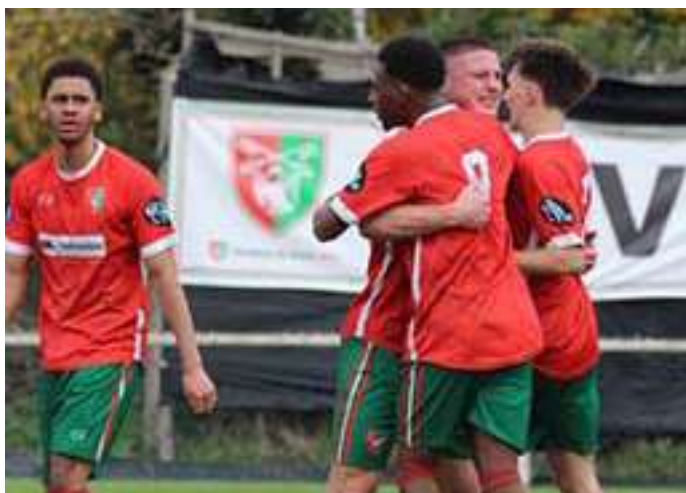
CHALFONT ST PETER

This victory ensured the Saints moved away from the danger zone although they are keen to establish midtable safety.