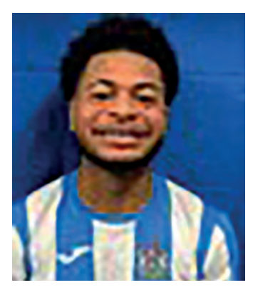
MOHAMMED ALI Please Sponsor Me