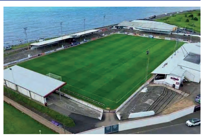
WHO PLAYS AT THE GROUND PICTURED? Answers on Page 14